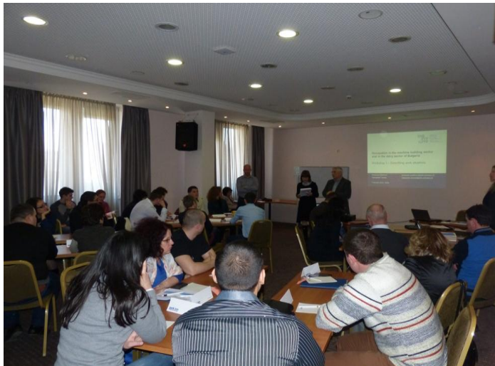
First Dual Education Seminar for teachers and companies, February 2015

Through the enlargement contribution, Switzerland helps reducing economic and social disparities in the enlarged EU. Swiss contribution to Bulgaria amounts to CHF 76 million as agreed in the Bilateral Framework Agreement. Switzerland is providing support in areas where Bulgaria has claimed great need for catching up, and in which Switzerland can offer know-how and expertise. The areas cover topics such as security and reforms, support of the civil society, integrating minorities, environment and infrastructure, promotion of the private sector, research and education as well as supporting institutional partnerships. The focus is on projects that contribute to enhancing bilateral cooperation and mitigating disparities between least and more developed regions of Bulgaria.